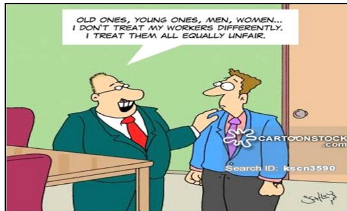
Figure 1: Is this an ideal Employer - Employee relationship