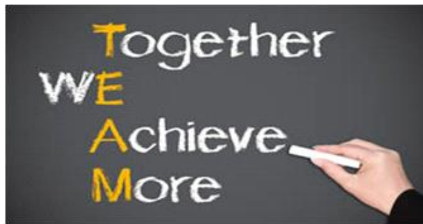
Figure 5: Recognizing the Employer - Employee relationship

This research-paper has focused on the impact of Employee - Employer relationship on organizational structures and the strategies of business organizations, and on how companies may resolve the inherent dilemma associated with balancing the conflicting adaptive pressures associated with short-run efficiency and long-run effectiveness. The research-paper has also shown that organizational structures regulate the flow of information within the organization, which leads to effects on both the strategic intent and the realized strategy of business organizations. The research-paper has in particular emphasized the basic adaptive challenge of exploration versus exploitation, first emphasizing the conventional view that pose these as opposites, and then contrasting the conventional view with the notion that organizations can achieve ambidexterity by implementing dual structures.