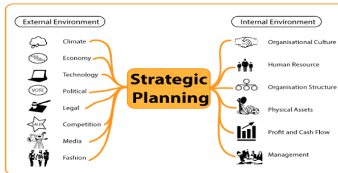
Figure 4: Internal Environmental Factors

The culture within the organization is a very important factor in business success. The attitudes of staff and volunteers, and their ability to "go the extra mile" make a very significant difference. Negative attitudes can severely impact on the organization's ability to implement strategies for development despite however thorough the planning processes. Positive attitudes of staff and volunteers will not only make the management task easier but also will be noticed and appreciated by customers of the business or members of organization.