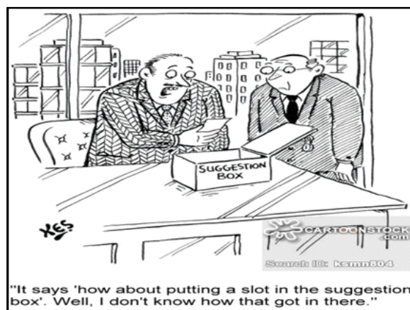
Figure 2: The Myopic Employer!

At the outset let me admit that the objectives have been a little ambitious for a research paper of this nature. But the volume of data and research work on related areas unearthed during the literature survey was so enormous that the researcher was encouraged to proceed further. (Like Figure 2, there can be a myopic researcher!). So, a comprehensive review of literature was made and the web sites and printed literature in the form of previous research papers, periodicals, publications and books were available for reference and review in arriving at answers to above research questions. These references are mentioned at appropriate places and a detailed list is given at the end of the paper.